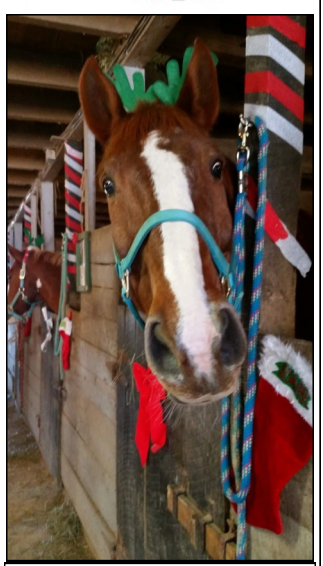
Moe at our Holiday Barn event.

enjoys a walk, trot and canter down memory lane with one of our instructors doing some dressage work with him.